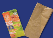
Cardboard & Paper