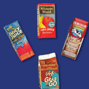
Milk Cartons & Juice Boxes