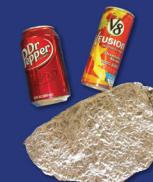
Cans & Aluminum Foil